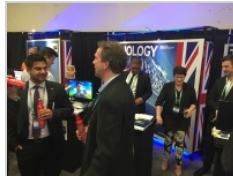
The British Pavilion

more information: http://www.ambassadorialroundtable.org